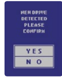
No Software or Drivers Mac, Linux and Windows Compatible