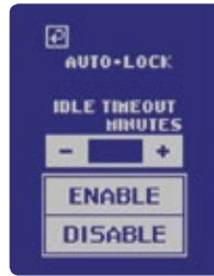
Auto-Lock Feature (Automatically times out the device when idle)