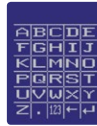
Alpha Numeric Keypad (For Strong Passwords)