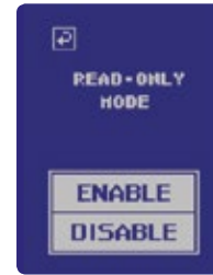
Read-Only Feature (Restricts users from overwriting or altering contents of the drive)