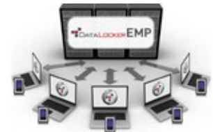
Compatible with DataLocker EMP ® (Encryption Management Platform) to Manage Multiple Devices available Q2 2015