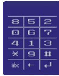
Rotating Keypad (To Prevent Surface Analysis)